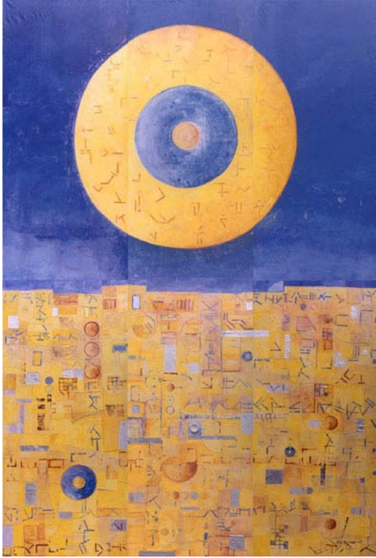
TITLE PLANET ABOVE THE CITY 1 YEAR 2001 SIZE 500 x 350 CM TECHNIQUE ACRYL ON CANVAS