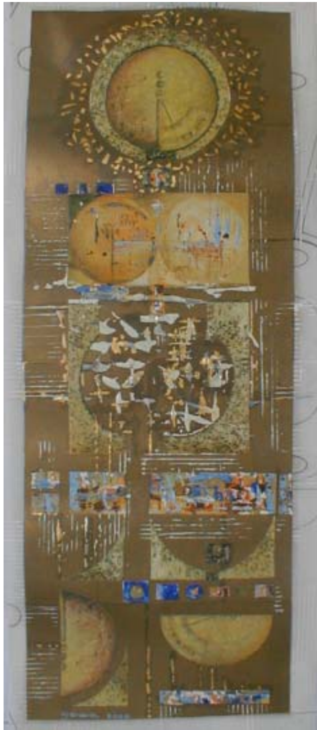
TITLE FEMININ ARCHETYPE YEAR 2001 SIZE 60 x 30 CM TECHNIQUE MIXED TECHNIQUE