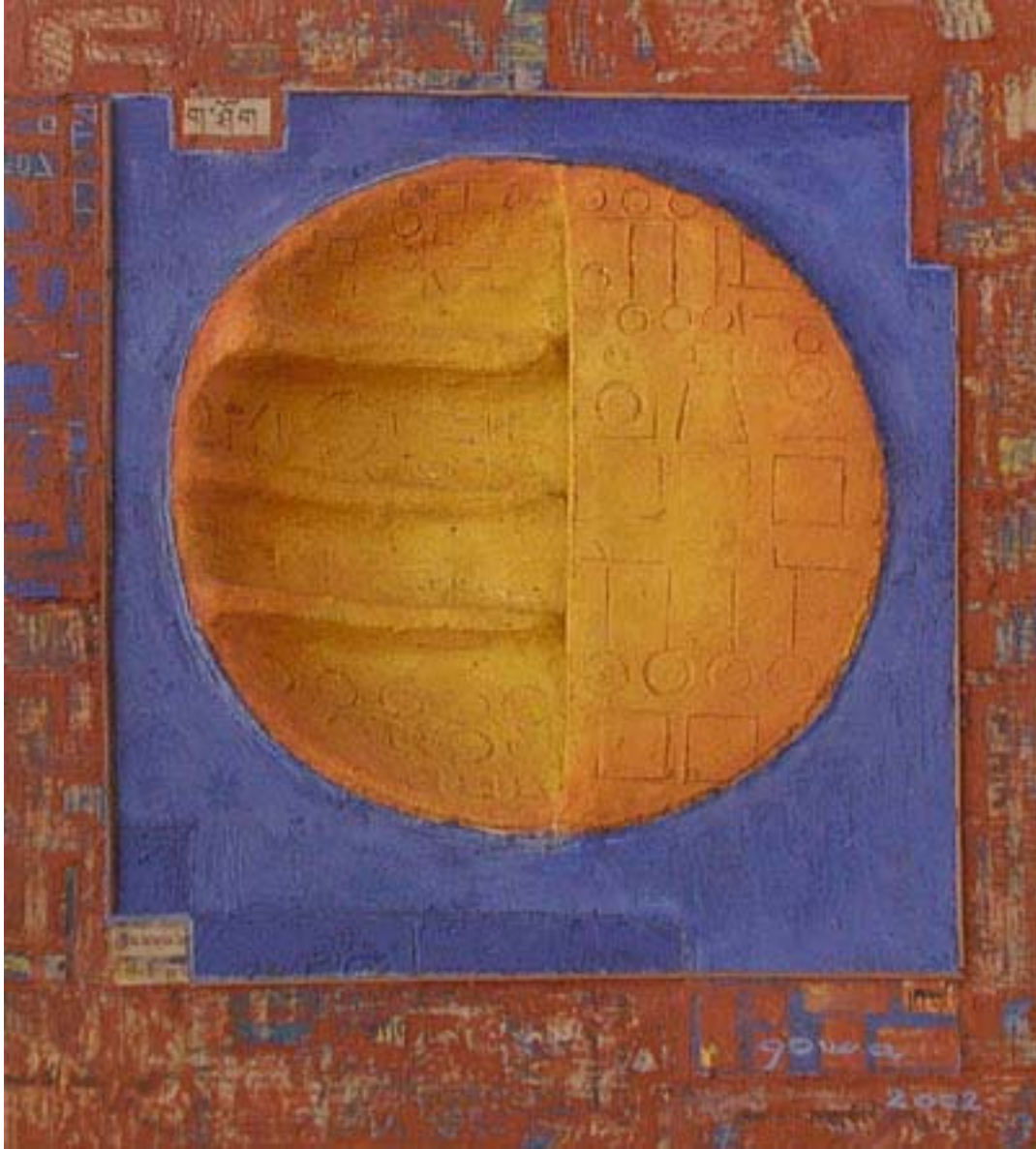
TITLE TIBETAN PLANET 2 YEAR 2002 SIZE 40 x 40 CM TECHNIQUE PAPIER-MÂCHÉ