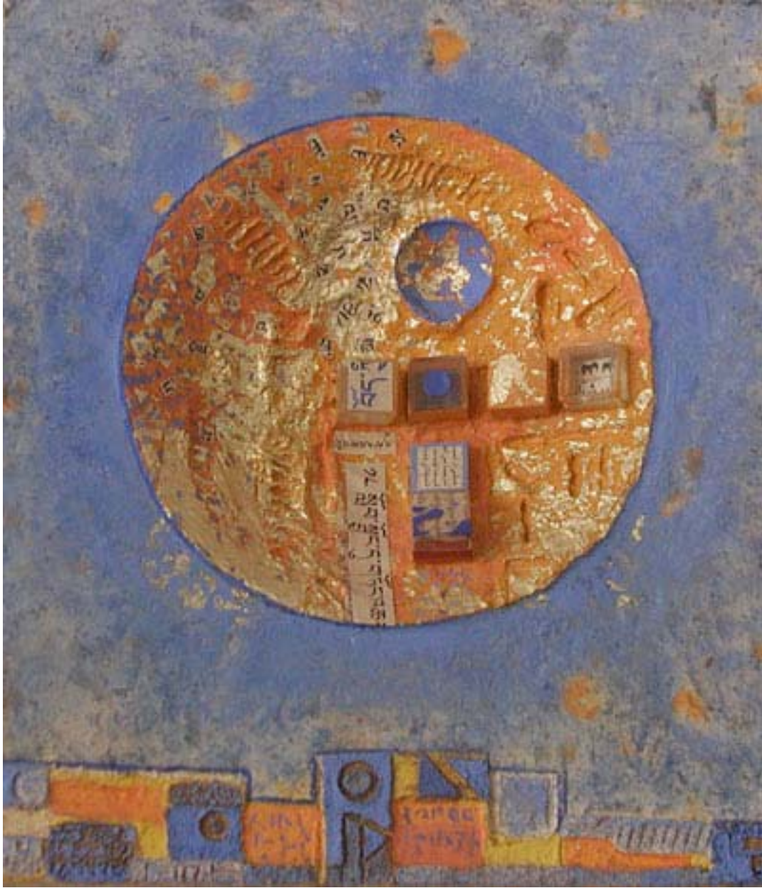
TITLE TIBETAN PLANET 1 YEAR 2002 SIZE 40 x 40 CM TECHNIQUE PAPIER-MÂCHÉ